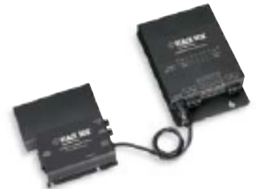
An example of a panel-mount industrial device with its power supply: Black Box Hardened Ethernet Switch (LB9901A).

The standardisation and ease-of-use provided by DIN rail has led to the widespread use of the DIN-rail mount power supply. This is by far the most common power supply you'll encounter in an industrial setting.