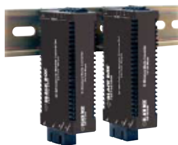
Black Box Industrial Multipower Media Converters (LIC023) shown mounted on DIN rail.

DIN rails are widely used for industrial applications, but are also readily adaptable to other applications. DIN rail can be used in a standard rack, on a wall, on a control panel, or anywhere a stable mounting platform is needed.