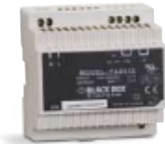
An example of a DIN-rail mount power supply: Black Box 24-VDC DIN Mount Power Supply (PSD012).

A metal rail called DIN rail is a standard mounting method for many industrial devices including switches, serial servers, power supplies, terminal blocks, and circuit breakers. DIN is an acronym for Deutsches Institut für Normung, a German member of the International Standards Organisation (ISO). Other common standards developed by this organisation are the DIN connector and mini-DIN connector.