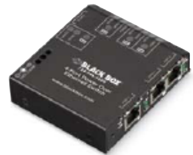
Example of a PoE device: Black Box 4-Port Power over Ethernet Switch (LP004A).

PoE can save money by eliminating the need to run electrical wiring. It also has the advantage of needing fewer components within the industrial area—for instance, instead of needing to mount a switch and a separate power supply, PoE enables you to have only the switch.