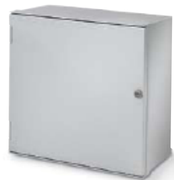
An example of a protective enclosure: Black Box NEMA 4X Equipment Cabinet (RM900A).

The NEMA 3R rating is identical to NEMA 3 except that it doesn't specify protection against windblown dust.